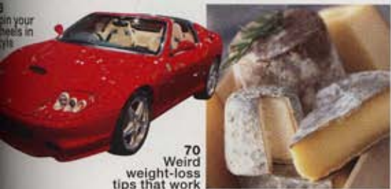
70 Weird weight-loss tips that work