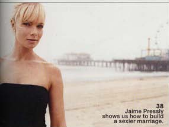
38 Jaime Pressly shows us how to build a sexier marriage.

Save your skin by detoxifying your shower routine (page 68), sculpt your stomach with sex, stretching, and the world's greatest abs exercise (page 72), and suit yourself in this season's most stylish sport coats (page 126) and ruggedly sophisticated accessories (page 132). This month, Best Life delivers everything you need to upgrade your image with confidence.